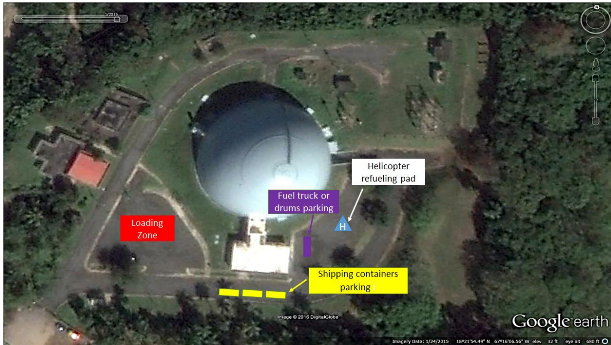
Figure 2. Proposed layout of Staging site Bonus Power Plant

order they will be flown will be created in advance of the external load operation. The air ops team and fork lift driver will arrive to the staging before sun rise and begin position the first loads.