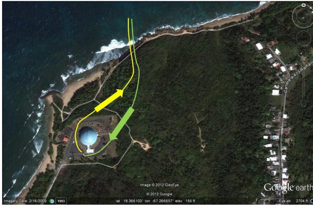
Figure 3. Proposed flight path to/from Desecheo from Bonus power plant.

departure direction along the flight path may be modified to account for local weather conditions on the day of flying and/or operational needs.