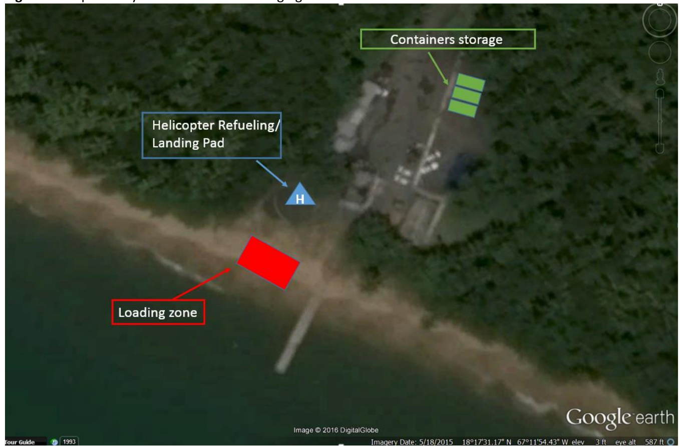
Figure 7. Proposed layout of Añasco FURA staging site.