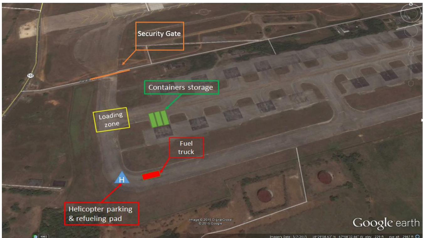
Figure 5: Proposed layout of the staging site at the Aguadilla airport.

The southern site at the Aguadilla airport is located on a disused airfield south of the active Aguadilla airport. Permission to use the southern site has been obtained from the Port Authority and the Air traffic control. Additionally, the proposed flight path over the road PR107 and the Borinquen Golf Course have been acknowledged to the FAAO-FSDO (Federal Aviation Administration-Flight Standards District Office) office in San Juan. Additionally it will be necessary to file a hold harmless agreement with the Aguadilla Airport prior to any aviation operation. As a safety precaution it is recommended that a professional security company be hired for some or all of the operation.