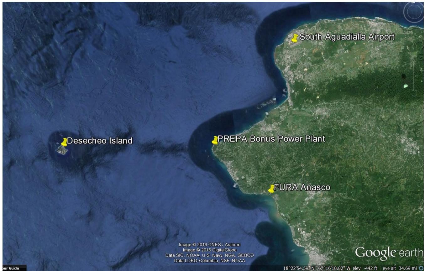
Figure 1. Staging site options for external load operations. All of these sites are considered acceptable for the external load operations from an operational perspective. The PREPA Bonus site is the planned and preferred alternative however if the PREPA Bonus site is unavailable the other two options are available as alternatives.

In the event that the staging site is not Bonus Power Plan facility in Rincon, one of the two backup sites mentioned will be used as the staging site. Proposed flight paths and layouts for the alternative staging sites can be found in Section 11. These flight paths have been approved by the managers of each staging site and by the FAA for overflying roads.